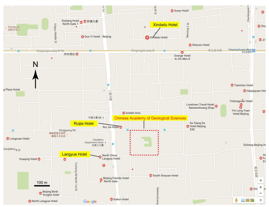
Fig. 2 Locations of the hotels around CAGS.

Standard room in the Adjacent Building ( Two stars ): RMB 280/USD 46 ( NOT including breakfast)